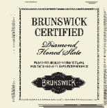
Brunswick Certified Slate

SuperSpeed® Cushions, recognized the world over for superior rebound, accuracy and consistency, and