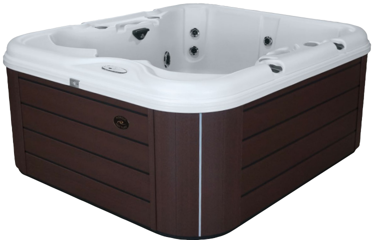
Shell: White | Cabinet: Mahogany