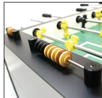
Goal and Match counters as used in tournament play